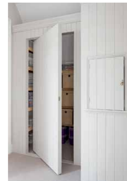
UPSTAIRS LANDING The cleverly designed pivoting door to this storage area is clad in tongue-and-groove panelling so it blends into the wall. Cupboard, price on application, Peter Higgins of Etons of Bath