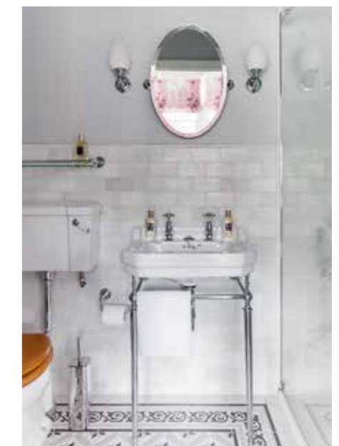
EN SUITE Provençal-style floor tiles add subtle pattern. Boulangerie floor tiles, £75sq m; Forecast wall tiles, £90sq m, Fired Earth. Burlington Edwardian basin with washstand, £539; Burlington Claremont taps, £139, both Victorian Plumbing