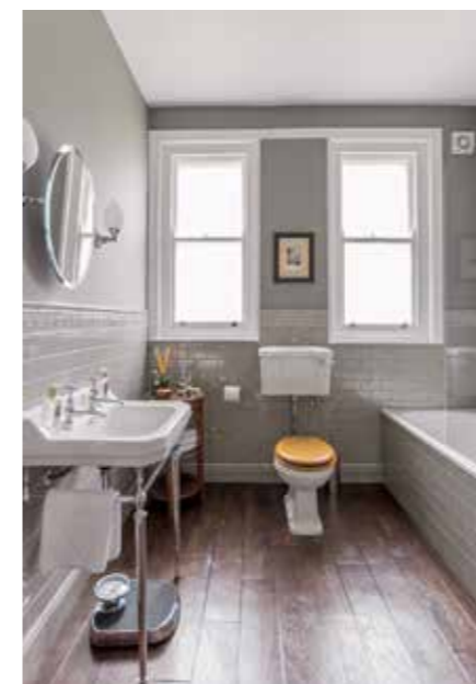
MAIN BATHROOM Traditional fittings suit this period setting. Burlington Edwardian single elliptical lights, £99 each, Victorian Plumbing. Art Select Hickory Peppercorn flooring, £40sq m, Karndean Designflooring

INSPIRATION 'We wanted a modern look that reflected the house's origins but which was stylish and practical, too – masculine but not harsh or austere'