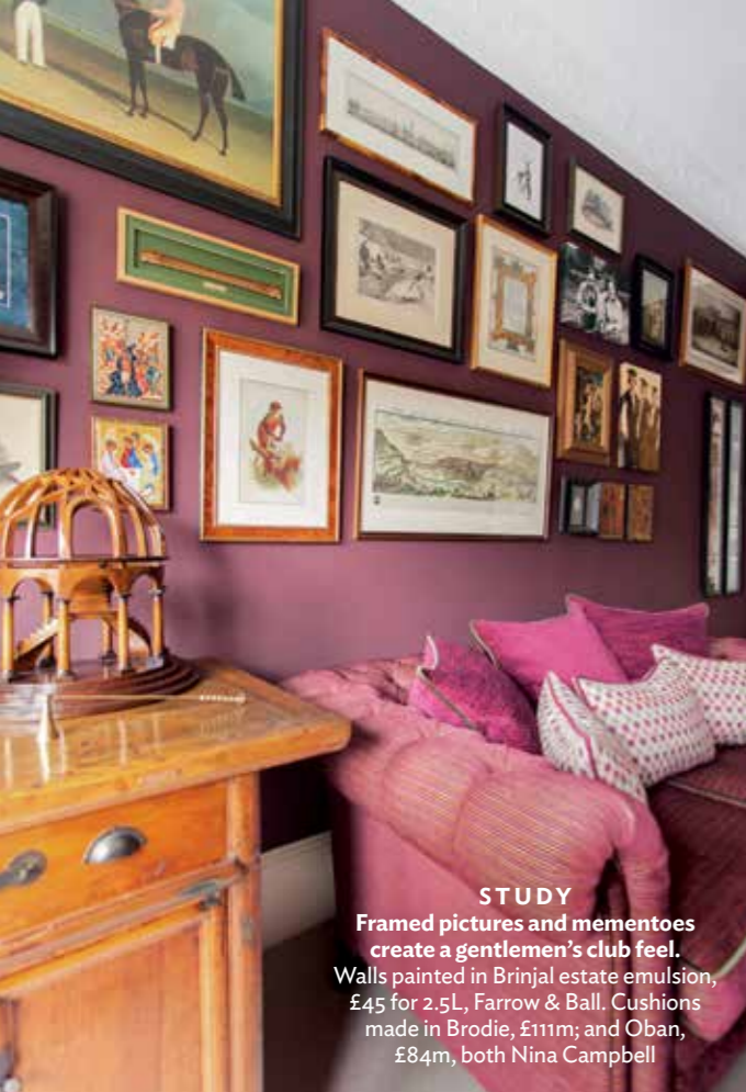
STUDY Framed pictures and mementoes create a gentlemen's club feel. Walls painted in Brinjal estate emulsion, £45 for 2.5L, Farrow & Ball. Cushions made in Brodie, £111m; and Oban, £84m, both Nina Campbell