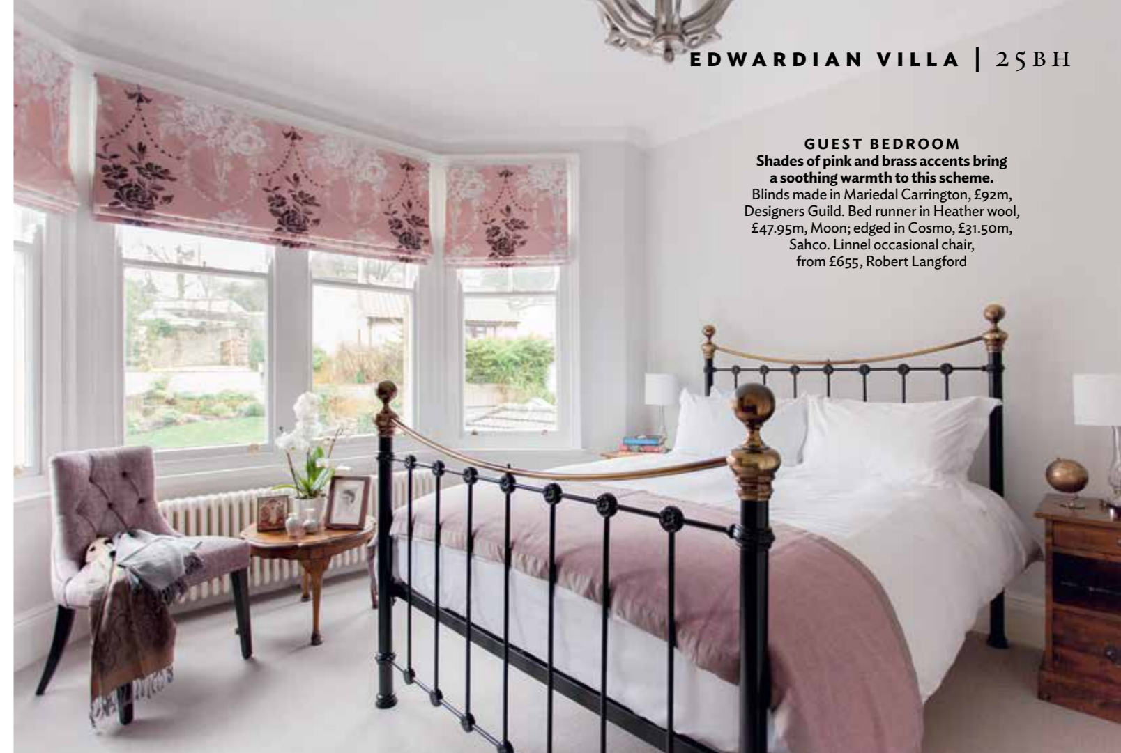
GUEST BEDROOM Shades of pink and brass accents bring a soothing warmth to this scheme. Blinds made in Mariedal Carrington, £92m, Designers Guild. Bed runner in Heather wool, £47.95m, Moon; edged in Cosmo, £31.50m, Sahco. Linnel occasional chair, from £65, Robert Langford