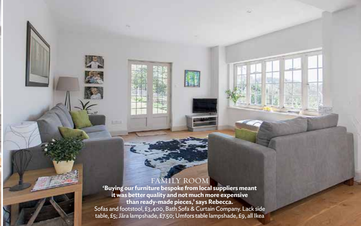
FAMILY ROOM 'Buying our furniture bespoke from local suppliers meant it was better quality and not much more expensive than ready-made pieces,' says Rebecca. Sofas and footstool, £3,400, Bath Sofa & Curtain Company. Lack side table, £5; Jära lampshade, £7.50; Umfors table lampshade, £9, all Ikea