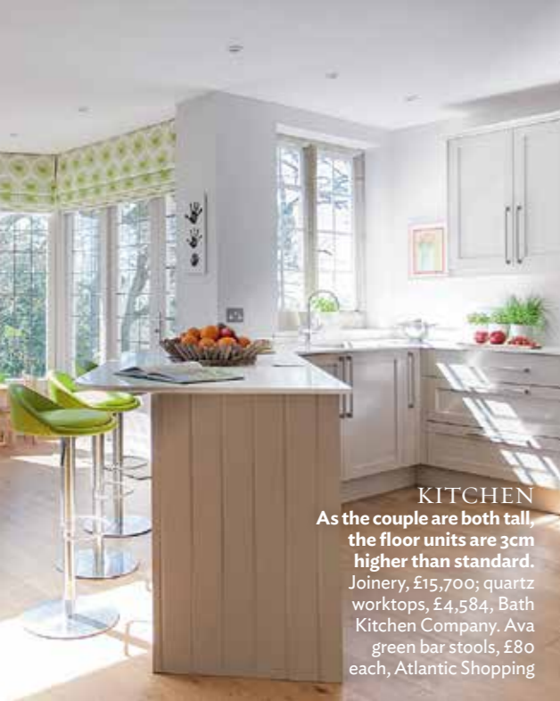
KITCHEN As the couple are both tall, the floor units are 3cm higher than standard. Joinery, £15,700; quartz worktops, £4,584, Bath Kitchen Company. Ava green bar stools, £80 each, Atlantic Shopping